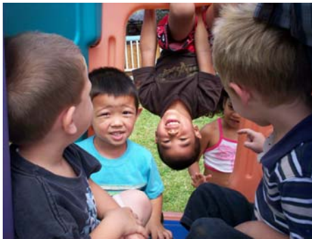
Nurturing Children & Youth