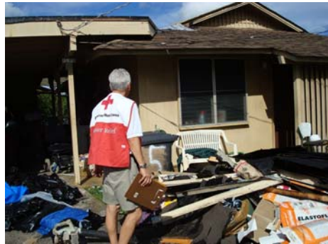
Responding to Basic Needs